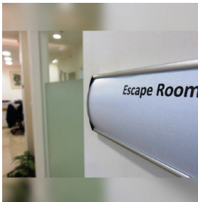
Using escape rooms in nursing education