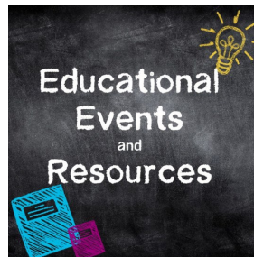
Learn from upcoming events & resources