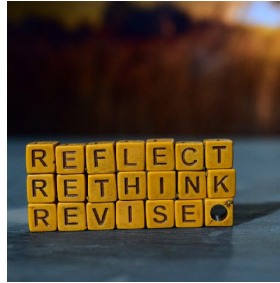
POGO Interlink Nurses share experience & tips