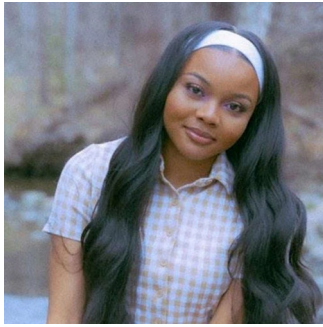
Little Pieces of Me