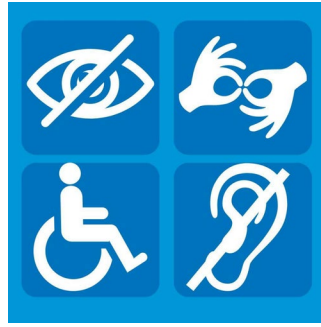
Accessibility to All