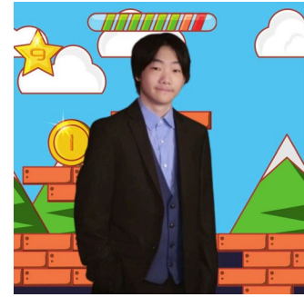
Inspiration from Gaming